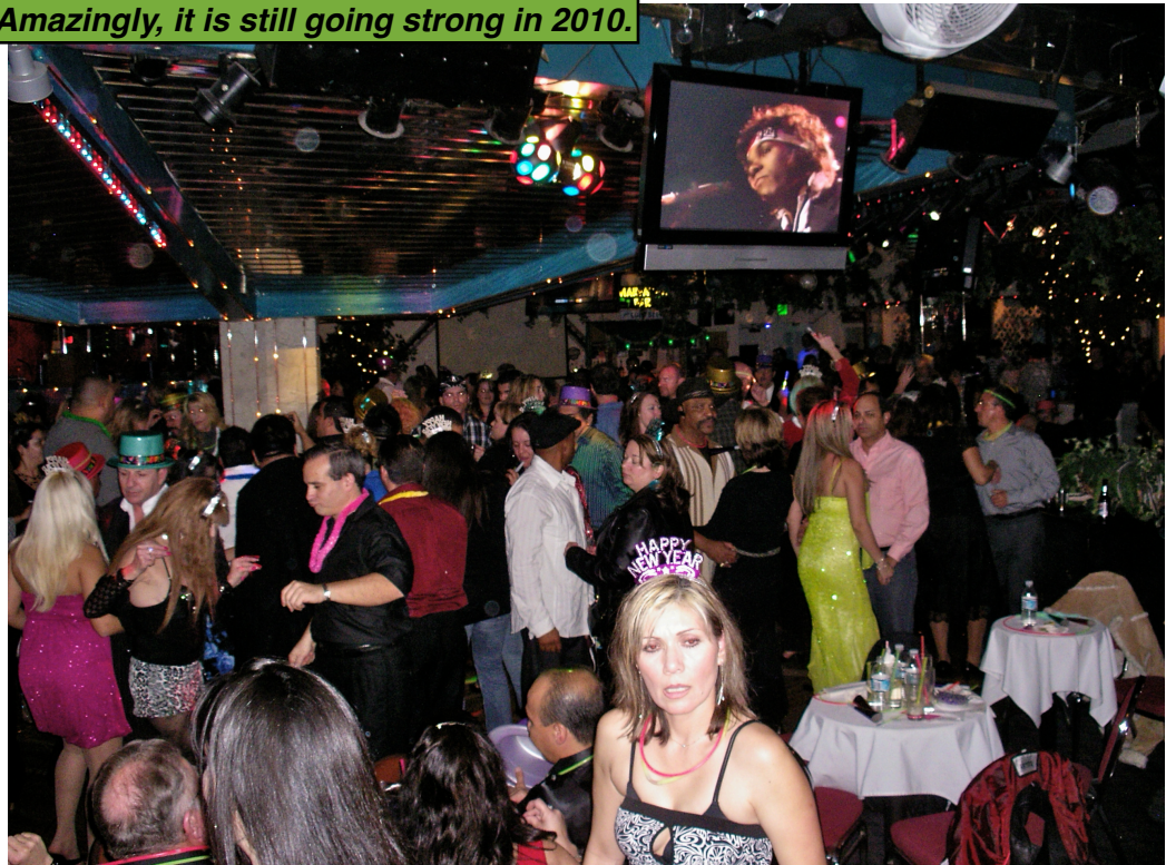
Some of the 1,000 plus Crocodile customers celebrating last New Year's Eve in Modesto, CA. Crocodile's now offers 12 large screen TVs up to 12 foot in size to add to everyone's dancing enjoyment.

I ran both clubs for about 3 years before selling the Turlock club and keeping the larger Modesto club. Now,