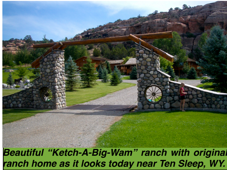
Beautiful "Ketch-A-Big-Wam" ranch with original ranch home as it looks today near Ten Sleep, WY.

Worland, WY C. of C. I created and operated " Ketch-A-Big-Wam ", a dude ranch in the beautiful Big Horn Mountains of Wyoming offering trout fishing, horse back riding, Sioux Indian dancing and lodging in