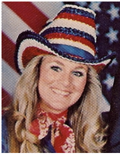
A special red, white & blue Candy Straw Hat created especially for Disneyland for America's 1976, 200th year birthday.

rainbow. Through a manufacturing force of about 50 women and a national sales crew calling on every western store in the country, "Candy Straw Hats" became a huge and instant success. We sold the company in 1976.