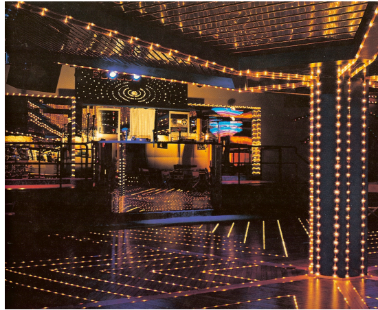
Billboard Magazine featured "Sports Page II" as Calif's. newest and largest disco with a story & this photo in 1978. Amazingly, it is still going strong in 2010.

knew absolutely nothing about the bar business but I ended up buying the club which necessitated me ending my Chattanooga career and the terrible commute. I completely gutted the building and opened "The Sports Page", the area's